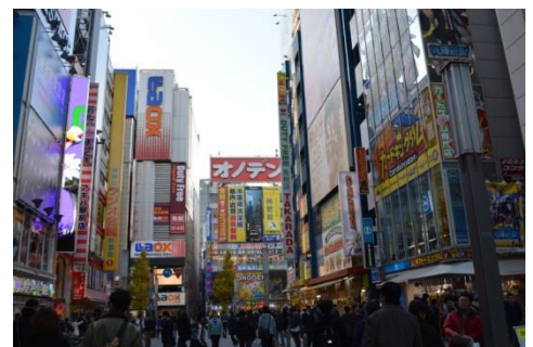
A shop in Akihabara Electric Town (Tokyo) Electronic goods from computers to household items can be bought in the area.

The economy bottomed out at the beginning of 2002, entering a period of slow but steady recovery that has continued through the middle of the decade. After lingering for more than 10 years, the negative aftereffects of the bubble-economy collapse finally appear to have been largely overcome. The non-performing loan ratio of major banks fell from over 8% in 2002 to under 2% in 2006, and this has contributed to a recovery in bank lending capacity as banks are once again able to fully function as financial intermediaries.