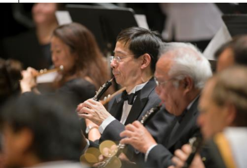
An orchestra

By the early 20th century there were connoisseurs of Western classical music in sufficient numbers to attract the attention of European performers, some of whom came to Japan to give recitals or mount concert tours. In 1926, the New Symphony Orchestra was formed and, in 1927, regular performances began. In 1951, the orchestra was renamed the NHK Symphony Orchestra. Today, it is sponsored by the NHK Broadcasting Corporation and is Japan's leading orchestra. Since 1950, the Japan Contemporary Music Association has held an annual festival to promote composition. Notable postwar composers include Dan Ikuma, who wrote a charming opera, Yuzuru (1952; Evening Cranes ), based on a Japanese folk tale, and Mayuzumi Toshiro, who composed symphonic pieces inspired by esoteric Buddhism. Takemitsu Toru, a composer of respected avant-garde pieces, has also written music for the cinema and is known worldwide. Many Japanese musicians have gone abroad to study, and some, such as the conductor Ozawa Seiji, the violinist Goto Midori, and the pianist Uchida Mitsuko, have established enduring international reputations.