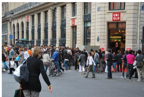
UNIQLO expands oversea (photo of its Opera store in Paris)

In the immediate postwar era, the involvement of Japanese businesses in overseas economies centered on the export of goods. In the 1980s, direct overseas investment by businesses began to grow.