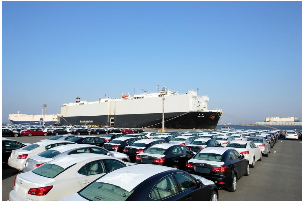
Automobiles ready for export