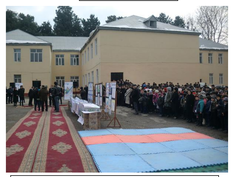
Educational material and drawings by students