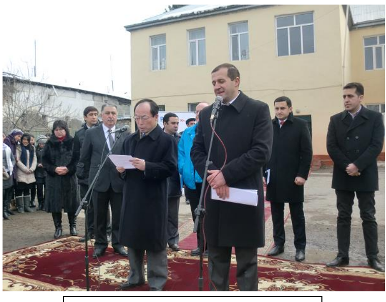
Sanitary facility of M. Isayev School