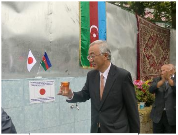
The ceremony was held next to one of Tap-stands we constructed