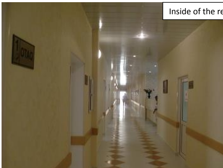
Inside of the renovated Surgery Unit