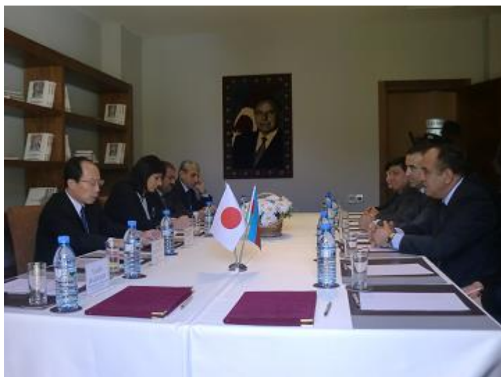
Ambassador Mr. Takahashi made a speech in Azerbaijani language

The project aims to construct a new medical point in Jalayir village in order to improve the level of medical service to be provided for residents of Jalayir village and surrounding one more village. The total amount of the Japanese Grant Assistance for this project is about USD 102, 975 .