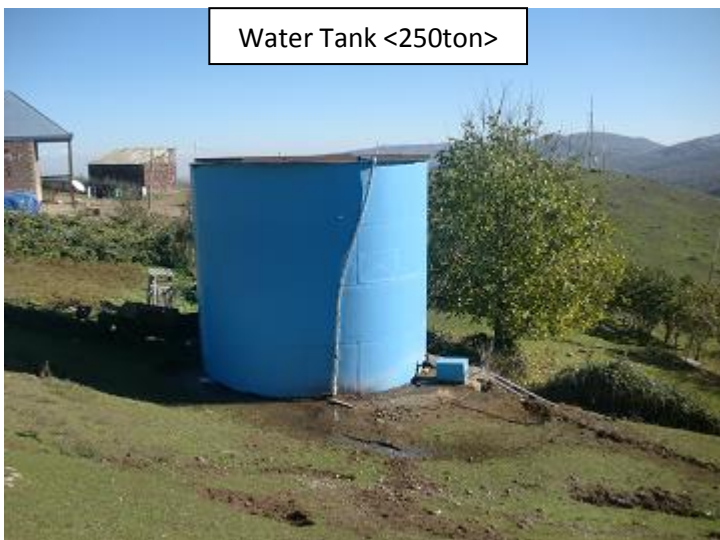
Water Tank <250ton>