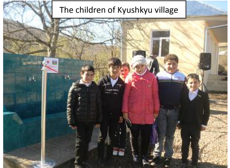
The children of Kyushkyu village