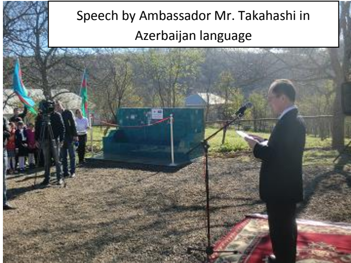
Speech by Ambassador Mr. Takahashi in Azerbaijan language

The project aims to construct a new water supply system in order to improve the access to drinkable water for the resident of two villages of Goygol region. The total amount of the Japanese Grant Assistance for the said project is USD 103,083 .