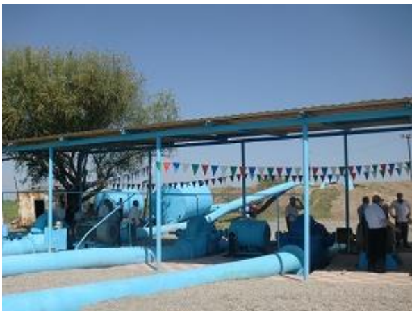
Water Supply System