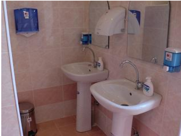
Inside of the facility