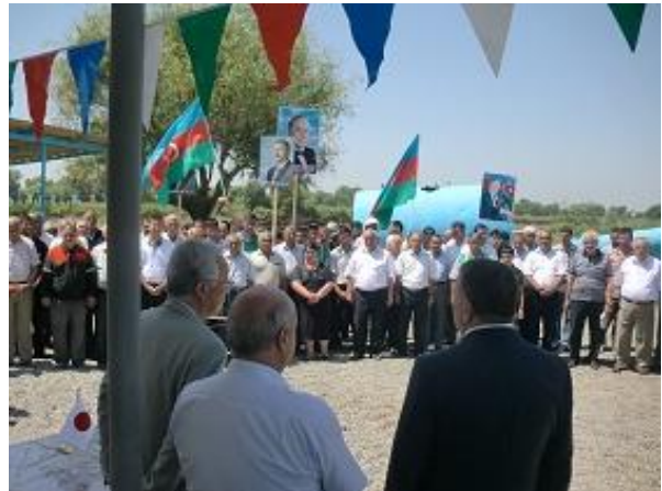
The opening Ceremony