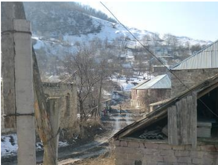
Uchbulag village of Goygol Region