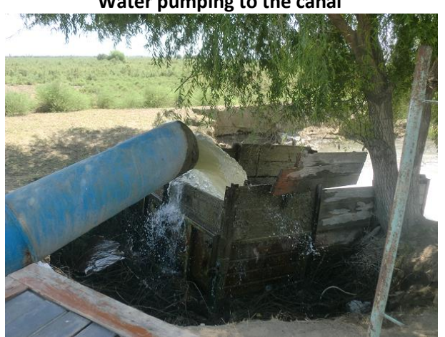
Water pumping to the canal