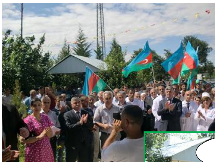
Participants of the ceremony

The project aimed at improving access to medical services for the residents of Gullutepe village as well as surrounding 5 villages through construction of the new building and provision of equipment. The number of the beneficiaries from the project is about 6,800 persons. Total amount of the Japanese Grant Assistance for this project is about USD 110,957.