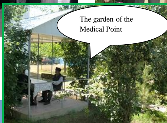
The garden of the Medical Point