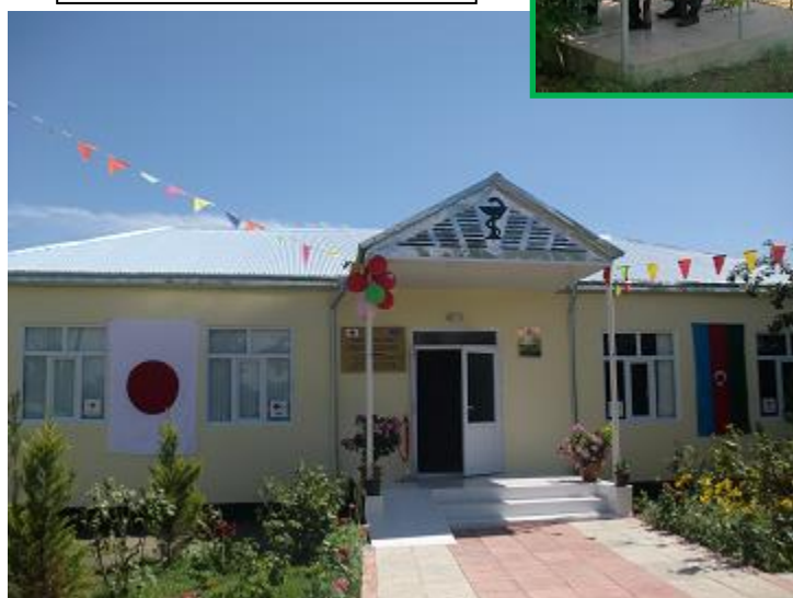
New Medical Point Building