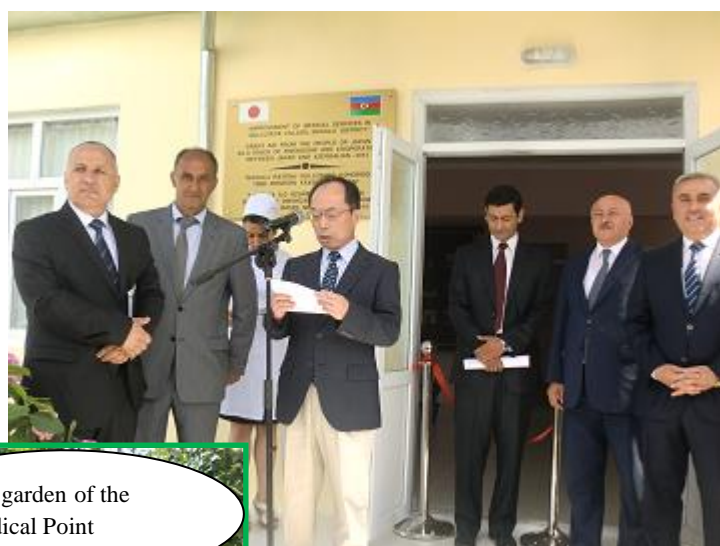
Ambassador's speech in Azerbaijani