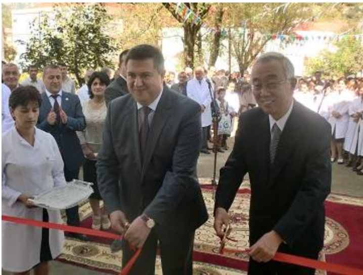
Renovated Lerik Children's Hospital