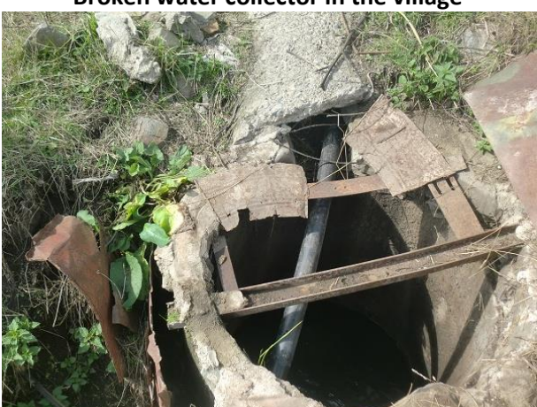
New water supply system will be constructed by the project by the end of this year.