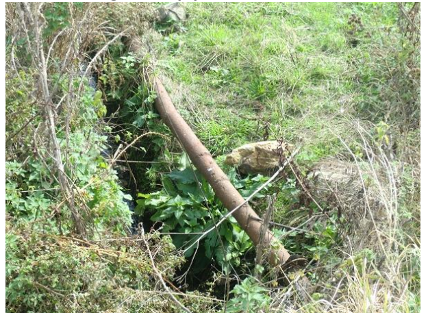
Rusting water pipe which is unusable