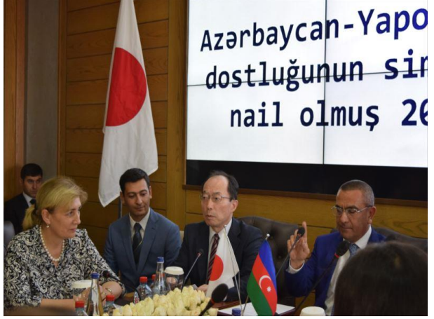
Speech by Ambassador in Azeri language