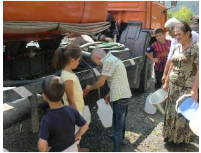
Villagers getting drinkable water from trucks

The project aims to improve the preschool condition for the children living in Mijan and neighboring villages throughout construction of new kindergarten building in Mijan village. The total amount of the Japanese Grant Assistance for this project is about USD 123, 050 .