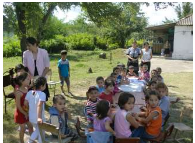
The children at Mijan Kindergarten