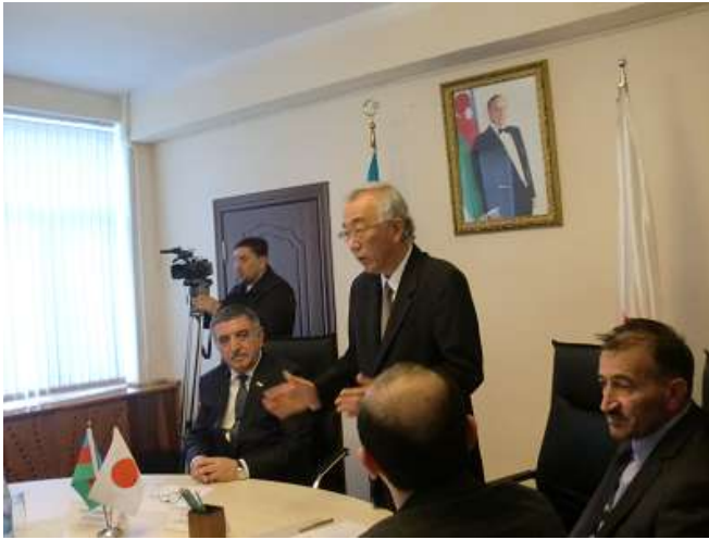
Speech by H.E. Ambassador Mr. Watanabe

The project aims to improve the drinkable water system of two villages of Zagatala region. The number of beneficiaries will be 3128 persons. The total amount of the Japanese Grant Assistance for this project is about USD 123,403 .