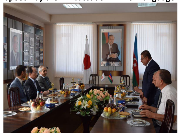
Speech by the Ambassador in Azeri language